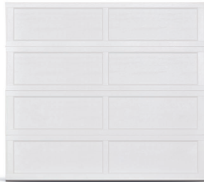
Long Panel: 2294