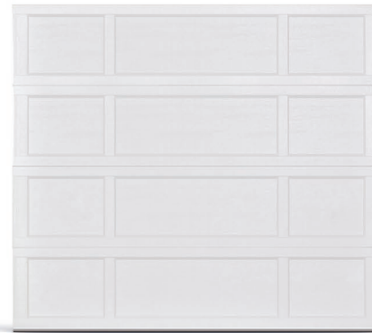
Combo Panel: 2296