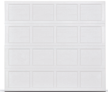
Short Panel: 2298