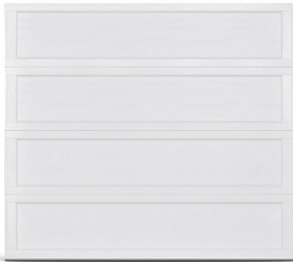
Flush Panel: 2294 Flush